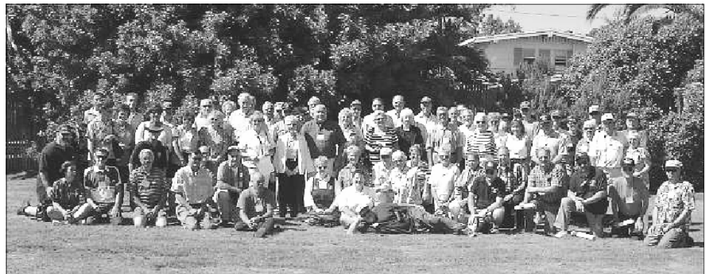
More than 70 people attended the memorial service held on Saturday, the 20th of July.

Seabees of NMCB-8, along with their wives and friends, celebrated the largest and best All Seabees West Coast Reunion 19-21 July 2001.