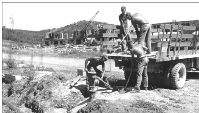
Ongoing construction at Leeway Point in GTMO Cuba in 1954.