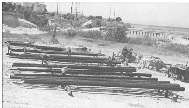
At GTMO an EIGHT platoon from "D" Company is guniting and staging telephone poles, to be used as piling for a dock to be constructed by a follow-on battalion.