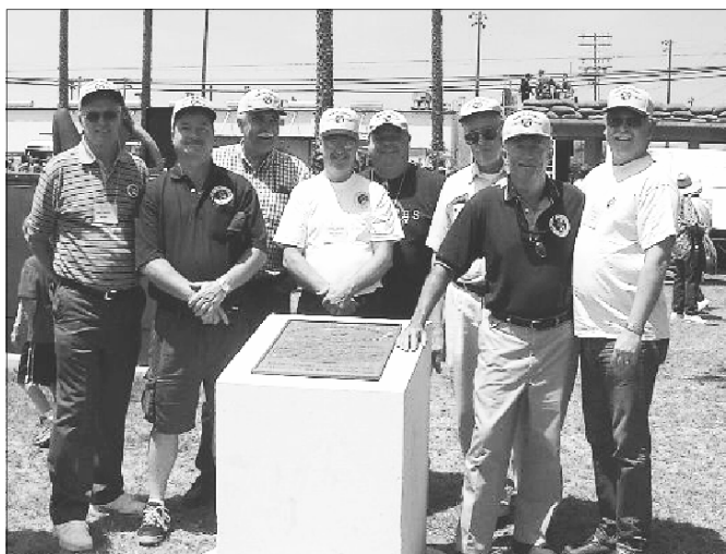
Men of EIGHT gathered around the NMCB-8 de-commissioning plaque after the Seabee Days pass in review.