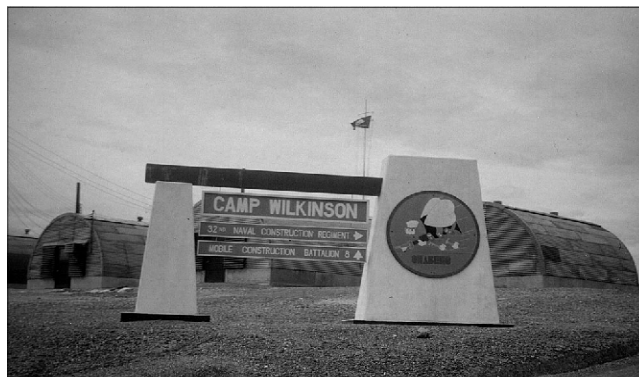
A view of Camp Wilkinson 1968.