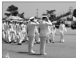
“Pass in Review”