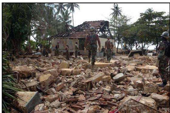
U.S. Navy Seabees assigned to Naval Mobile Construction Battalions Seven (NMCB-7), survey the site of a schoolhouse destroyed by the Dec. 26th Tsunami in the village of Koggala, Sri Lanka.