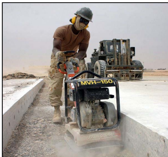
Seabee assigned to Naval Mobile Construction Battalion Two Four, (NMCB 24) re-levels and packs the base of an airfield runway expansion joint trench at the air base in Al Asad, Iraq.