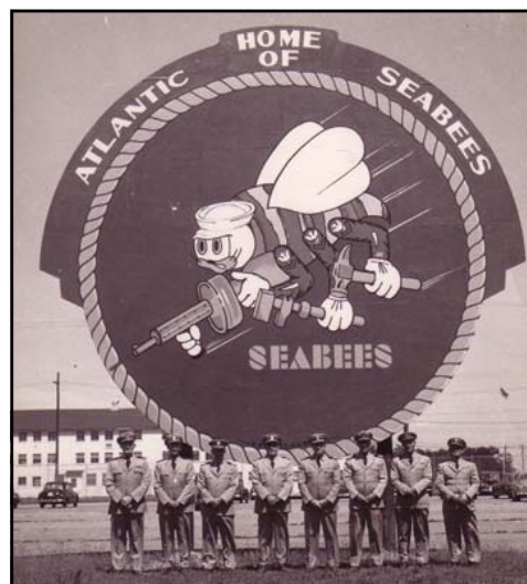
COMCBLANT, Davisville, RI