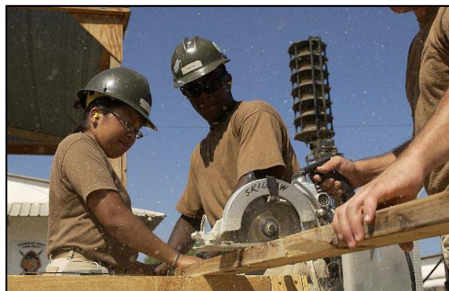
Camp Lemonier, Djibouti. Seabees assigned to Naval Mobile Construction Battalion Three (NMCB-3), Joint Task Force-Horn of Africa cut wood for three new buildings.