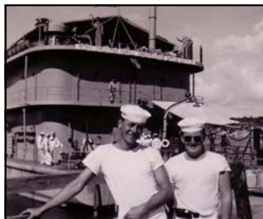
The APL (Apple) rigged out for Christmas - Gitmo style