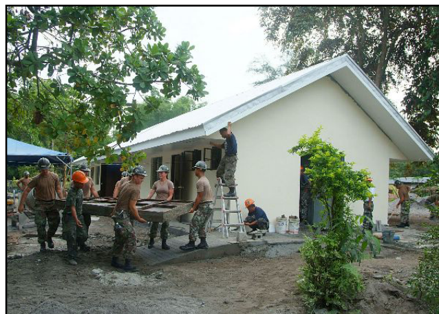
Construction personnel from Philippine Navy, and U.S. Navy Seabees assigned to Naval Mobile Construction Battalion Five (NMCB-5), put the finishing touches on a two-room schoolhouse in San Narciso