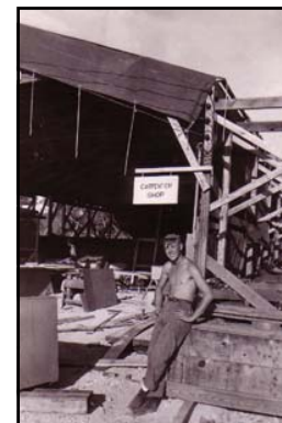
GITMO Carpenter Shop