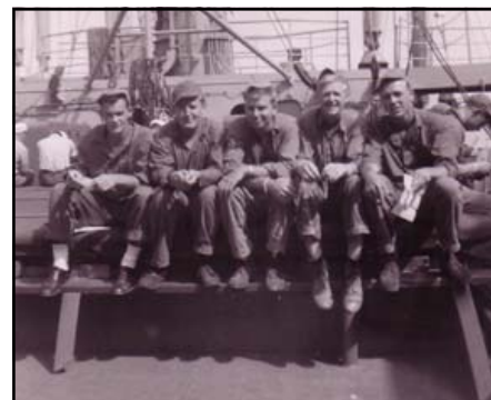
In our greens at sea, heading for Port Lyautey, Morocco