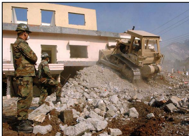
U.S. Navy Seabees assigned to Naval Mobile Construction Battalion Seven Four (NMCB-74), clear debris at the Ministry of Education Building in Muzaffarabad, Pakistan.